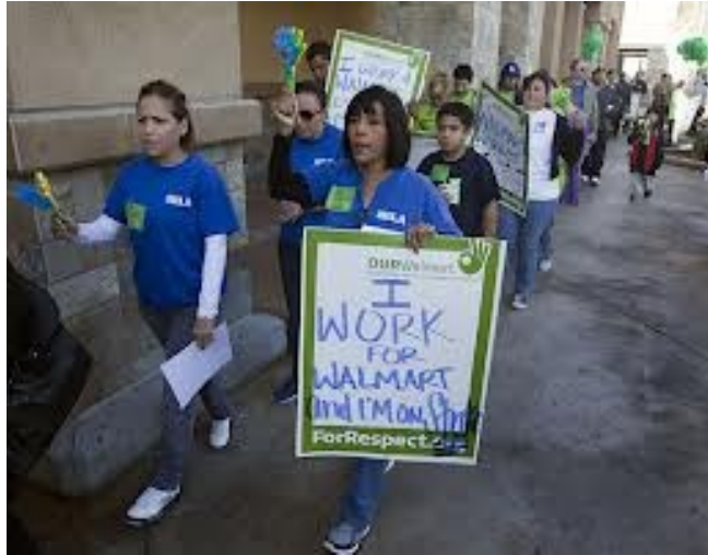
According to Marxist theory, labor movements are an inevitable consequence of capitalism.

(For example, under a monarchy, the belief that kings and queens are divinely appointed justifies their power.) In capitalist systems, bourgeois ideology helps prevent a worker uprising by, for example, reinforcing the notion that individual talent and especially effort is the key to economic success, so those that do not succeed have no one to blame but themselves. This ideology suggests that the route to prosperity for workers is to compete against each other, not to band together to further their interests. The failure of workers to recognize their common interests is called false consciousness , and Marx surmised that overcoming this would be a major task for any revolutionary movement.