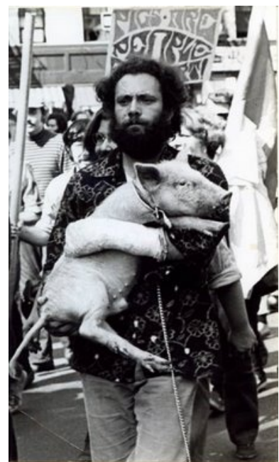
Pigasus, the pig who was nominated for president by antiwar protesters outside the Democratic National Convention in 1968. This is an example of social movement activists using an established institutional channel (in this case, running for political office) in an innovative way.

Why would a group choose to use noninstitutional methods to create change, when institutional ones are available? The answer is that not all groups have easy input in to major social institutions. People who form social movements oftentimes do so because they are excluded, for whatever reason, from accessing power through mainstream processes. For example, before the 1960s, African-Americans were effectively denied the right to vote or run for office in the southern United States. Hence the civil rights movement used tactics like sit-ins and marches to racially integrate southern society. As noted above, then, the people that form social movements--who resort to extra-institutional means of making change--are very often those who