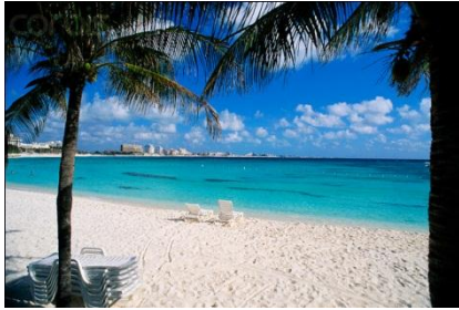
Nice day at the beach