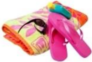
Flip flops, beach towel