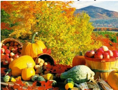
Leaves, apples and pumpkins